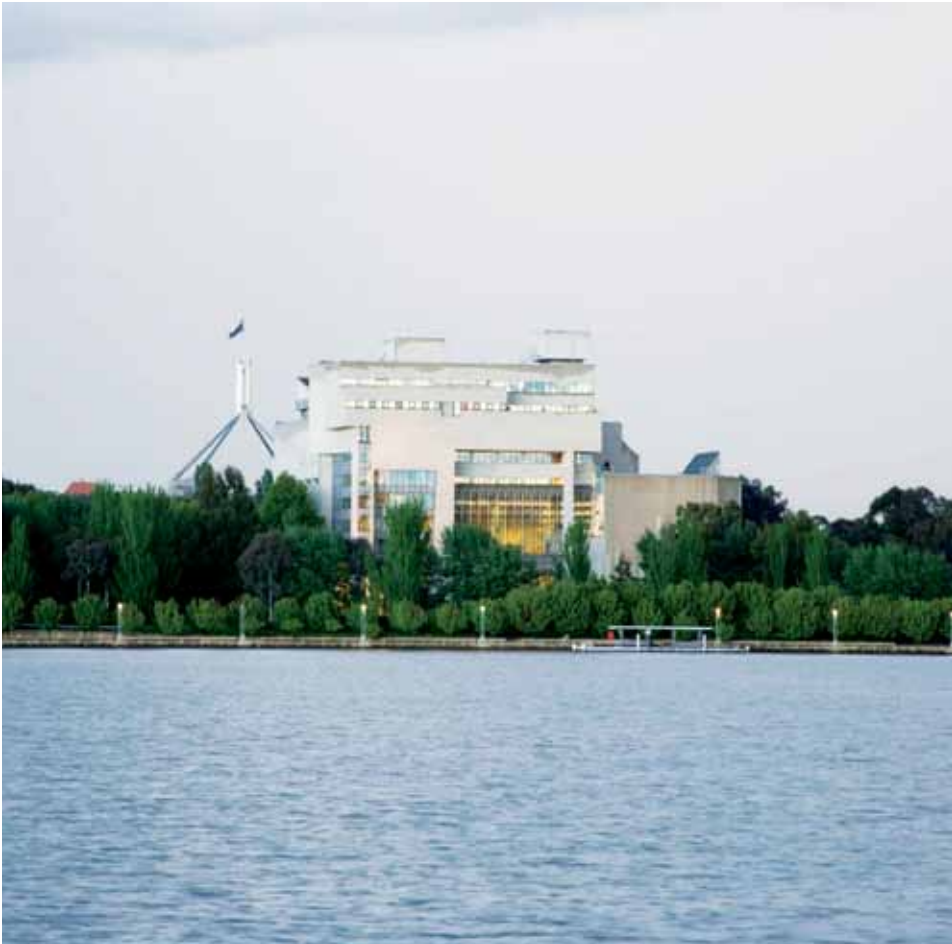
Image: A north-easterly view of the High Court building.

The work of the APJRF is managed by a Secretariat comprised of Australian judges, the Chief Executive and Principal Registrar of the High Court of Australia and the Chief Executive of the Judicial Commission of New South Wales. The Secretariat is chaired by the Honourable Justice Kenneth Hayne AC of the High Court of Australia.