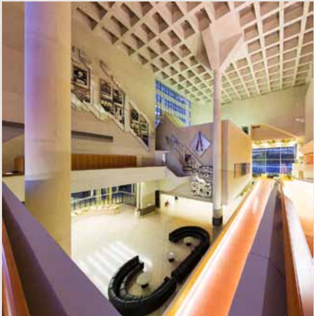
The Public Hall

The glazed areas totalling 4,000 square metres use steel frame supports which means that generous expansion allowances had to be provided to cope with Canberra's wide temperature range. A system was devised so that the glass in the walls can creep up or down according to the temperature changes and any movement in the concrete structure.